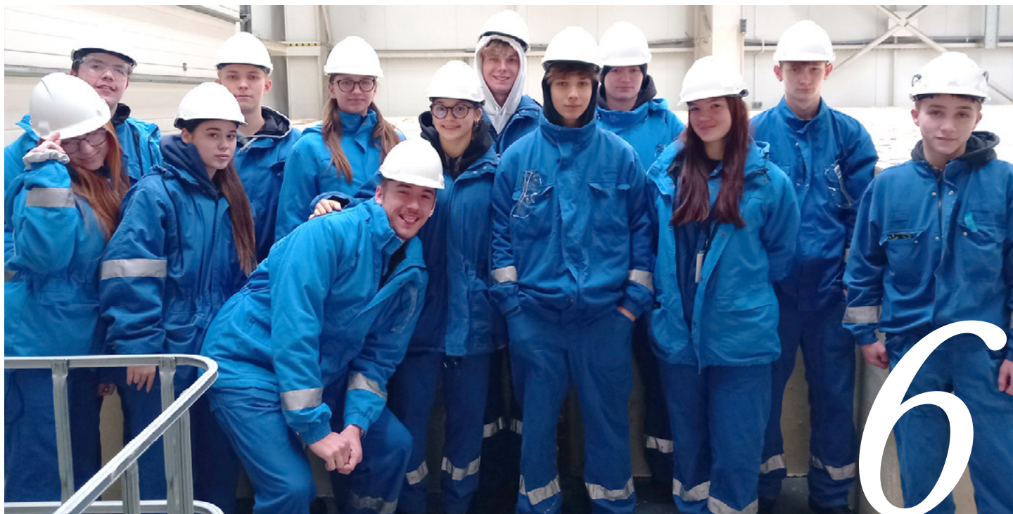
Table of Contents/April 2026