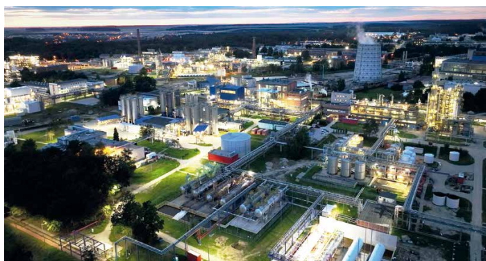
Aerial view of our chemicals site in Brzeg Dolny where, primarily, the majority of the manufacturing operations of our major subgroups PCC Rokita SA and PCC Exol SA are located